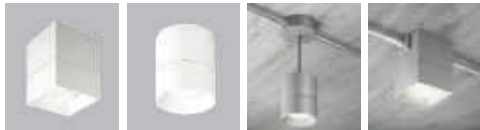
5" Surface Mount and Pendant

BeveLED Block Warm Glow Dimming is specifically designed for use with surface-mounted conduit and junction boxes in ceilings where recessed lighting is not possible. Perfect for lofts, offices, and open architectural spaces.