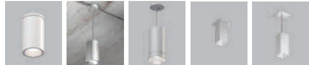
6" Surface Mount and Pendant

Power and beauty are both in play with our sleek architectural cylinders. USAI's Warm Glow Dimming Cylinders offer a beautiful, decorative solution with satin nickel and powdercoat painted finishes while still delivering high performance.