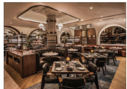
Project: Swift & Sons Lighting Design: Morlights Interior Design: AVRO | KO