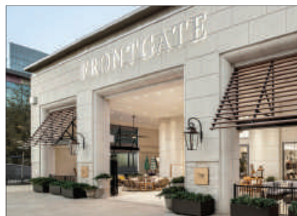
Project: Frontgate Architect: FRCH NELSON