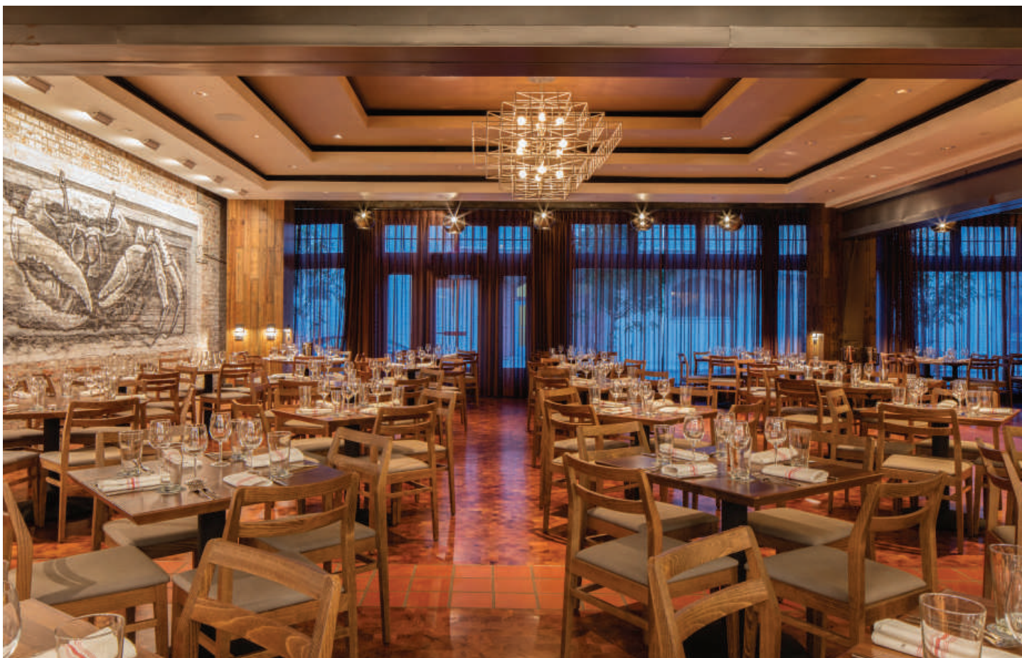
Project: Meril Architect: Rozas Ward Architects